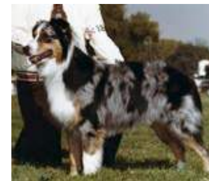
Dusty's son CH The Captain of Heatherhill. Born 1976. By Dusty x McCorkle's Blue Tule Fog.