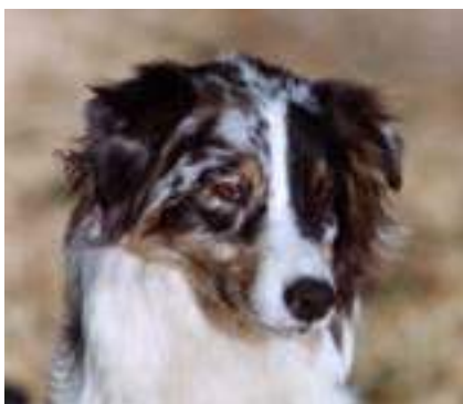
Dusty's daughter CH Briar Patch of Bonnie-Blu CD HOF. Born 1973. By Dusty x Wildhagen's Thistle of Flintridge HOF.