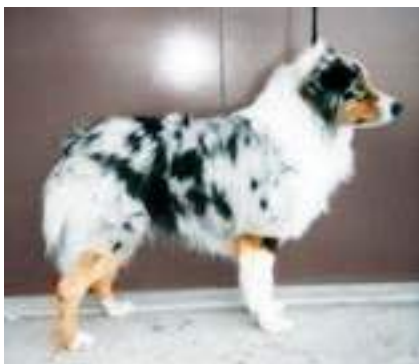
Dusty's son CH Command Performance of Hazelwood. Born 1979. By Dusty x CH Regal Vanda Berry of Hazelwood.