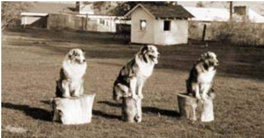
(Left to right) Salt of Flintridge, The Herdsman of Flintridge and Cactus of Flintridge.

Although we have been involved with and interested in Australian Shepherds since 1928, our present family of dogs, as far as we are concerned, is of rather recent vintage. This group of dogs really owes its type and origin to a female whose recorded name is Smedra’s Blue Mistingo. I obtained this female from a client of mine who I had previously advised to “buy an Australian Shepherd.” This lady took my advice but later moved into an apartment and I bought the puppy from her. Although I had several other dogs at the time I saw some characteristics in this dog that I admired very much and felt they were worth perpetuating. I gave her to a friend of mine with the agreement that if she were ever bred I was to receive the choice of the puppies. My friend bred her later to Harper’s Old Smokey and our choice of the litter was the female we called Blue Spice of Flintridge. In