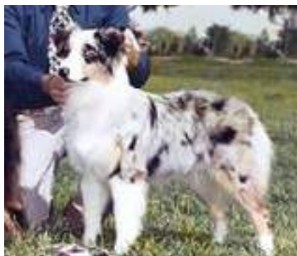
Dusty's daughter CH Sweet Seasons of Heatherhill. Born 1970. By Dusty x McCorkle's Blue Tule Fog.