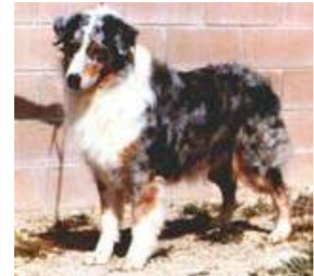
Heard's Salt of Flintridge. Born 1964. Grandsire of CH Wildhagen's Dutchman of Flintridge CDX HOF and CH Fieldmaster of Flintridge HOF.

impressed by the quality and consistency of the breed type in those dogs because it was in stark contrast to other Aussies of that time.