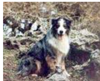
CH Final Edition of Windermere CD STDs ATDd "Eddie." Born 1980. By CH Windermere's Sunshine of Bonnie-Blu CDX HOF x Fisher's Blue Heather of Windermere HOF.