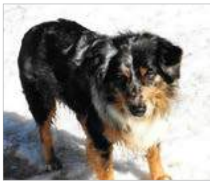
Dusty's great-grandson CH Aristocrat's Repeat Performance. Born 1980. By CH Fieldmaster's Cast The Die x CH Silvertone's Easy Money.