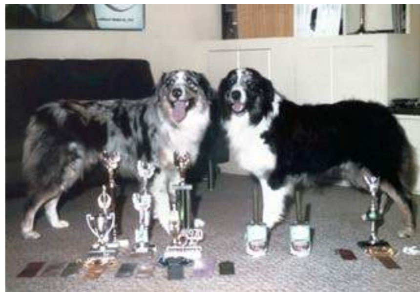
Dusty (left) and his brother Fieldmaster of Flintridge “Sage” (right) are shown with some of their trophies and ribbons. They were about one year old in this photo.