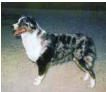
Dusty's daughter CH Grand Dutchess of Wynldham. Born 1978. By Dusty x Blue Lad Sugar Is Sweet.