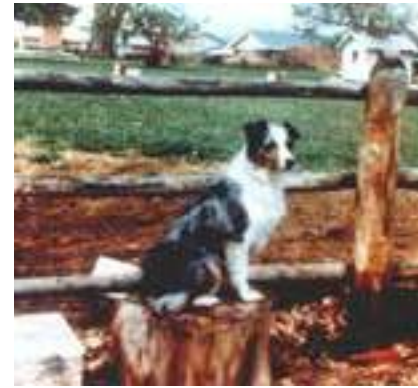
Heard's Savor of Flintridge. Born 1965. Dam of CH Wildhagen's Dutchman of Flintridge CDX HOF and CH Fieldmaster of Flintridge HOF.