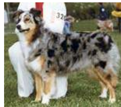
Dusty's daughter Tamishon of Bonnie-Blu. Born 1973. By Dusty x Wildhagen's Thistle of Flintridge.

http://www.workingaussiesource.com/stockdoglibrary/davis_history_article.htm