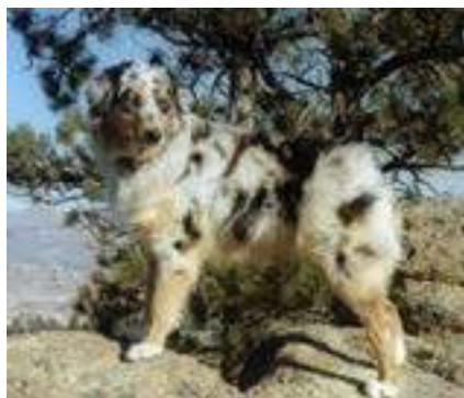
Dusty's son CH Coppertone's Cactus of Bonnie-Blu. Born 1973. By Dusty x Wildhagen's Thistle of Flintridge HOF.