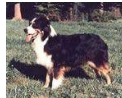
CH Christmas Wishes of Windermere CD STDcs OTDd "Chrissy." Born 1985. By CH Tri-Ivory Roquefort of Higgins CD HOF x Sunny Wishes of Windermere.