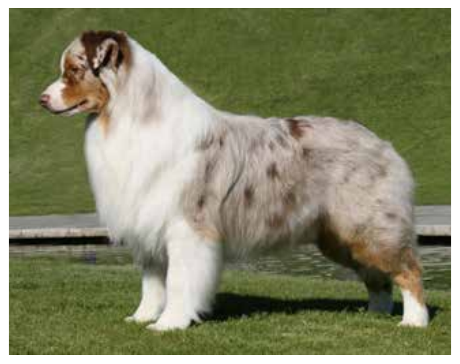
Yukon's grandson AKC-DNK-GBR-NOR-DEU CH Thornapple Aftershock "Diablo." Born 2003. WW 2008, VWW 2012, Crufts W 2007, 2008, 2011, 3 x DK W 2006, 2007, 2009. By CH Ragtime's Light It Up x AKC CH Thornapple Silken Flame. (DENMARK)

Yukon was a great sire whose sons and daughters also became outstanding sires and dams of the next generation. Yukon's name can be found in the pedigrees of many Australian Shepherds in conformation show rings today, both in the United States and abroad.