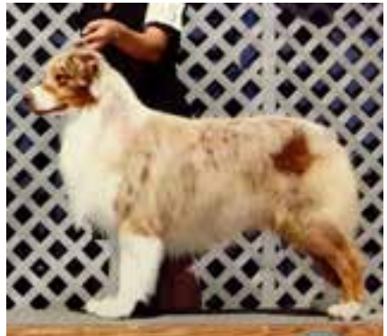
Yukon's son AKC-ASCA CH Rainyday's I'm On Fire HT ROM X-III ROM P-I ROM C-I ASCA HOF "Spark." Born 1999. By Yukon x Cobbercrest Propwash Obla-De USASA HOFX-ASCA HOF.