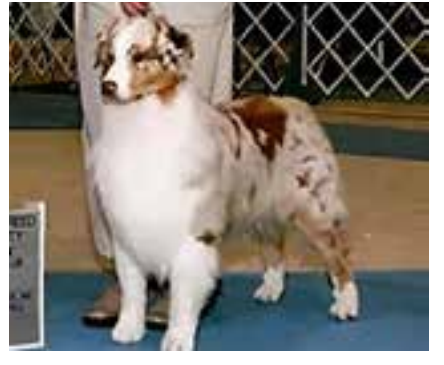
Yukon's son AKC CH Cobbercrest Red Ruffian. "Manny." Born 2000. By Yukon x AKC CH Thornapple's What It Takes.