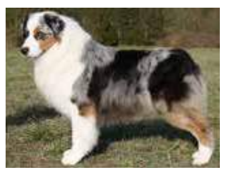
Yukon's great-grandson DNK-NO-PL-INT-KLB CH KBHV15 Leading Angel's Gaze At The Stars "Brad Pitt." Born 2012. By Multi CH Collinswood House Rules x DNK-NOCH-KLBVE CH KBHVV15 Thornapple Queen of Diamonds. (DENMARK)