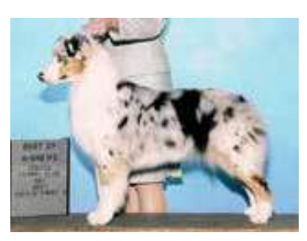
Yukon's double grandaughter AKC-ASCA CH Cedar Hill Bel Ami Park Ave Blues "Parker." Born 2009. By AKC CH Cobbercrest Red Ruffian x Cobbercrest Louisiana Hail Mary.