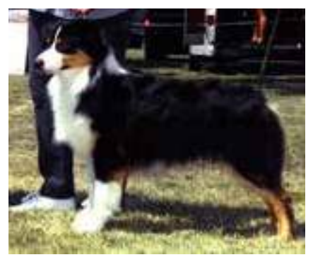
Yukon's son MACH CKC-UKC-ASCA CH After All's Under Cover AKC-ASCA CD AKC RN ASCA RNX STDds MXB MJS MXP MJP RS-E GS-N JV-E-SP SSA AD PJ3 HIT CGCA "Spencer." Born 2001. By Yukon x INT-UKC-ASCA CH Dewmoor Work of Art Afterall HIC ASCA HOF.