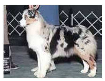
Yukon's daughter AKC CH Thornapple Bedazzled "Dazzle." Born 2000. By Yukon x Thornapple Godess of The Hunt.