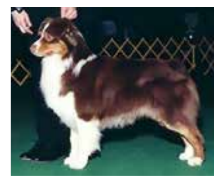
Yukon's son AKC-ASCA CH Cobbercrest Carpe Diem "Maverick." Yukon x Cobbercrest Rnydays Yoko Ono.