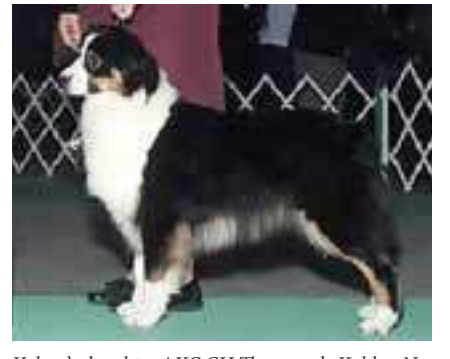
Yukon's daughter AKC CH Thornapple Kahlua N Cream "Kahlua." Born 2000. By Yukon x Paradox Ponder This.