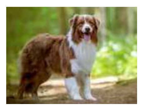
Yukon's great-grandson INT CH Leading Angel's Diamond Afterglow "Coffee." Born 2010. By Multi CH Thornapple Aftershock x Multi CH Thornapple Queen of Diamonds. (GERMANY)