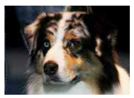
Yukon's great-grandson C.I.B DK CH DKV-10, FIV-10, NORDV-11, SEVV-16 Thornapple Mercury All Jacked Up "Jack." Born 2008. By AKC CH Thornapple All Fired Up x AKC CH Thornapple Straight Up. (SWEDEN)