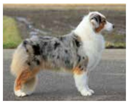
Yukon's great-great-granddaughter DJCH-Dutch CH Dailo's Thinking Out of the Box "Candy." Born 2014. By CH Dailo's Black Label x Dailo's Pocket Full of Sunshine. (NETHERLANDS)