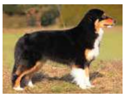
Yukon's great-great-granddaughter CH Clubwinner 2016 Los Perros Locos Cute Flowerpower VT RO-B RO-1 "Kate." Born 2011. By RisingStar Message In A Bottle x Old Kauri Tree Absolutely Cute. (GERMANY)