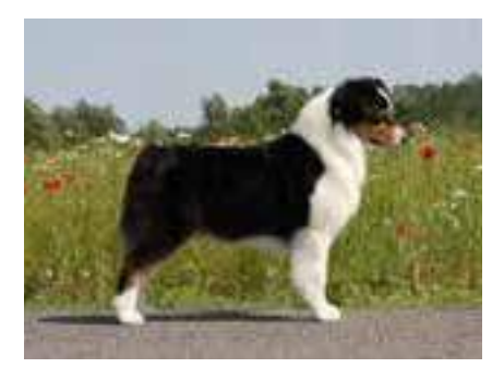
Yukon's grandaughter DNK-NOCH-KLBVE CH KBHVV15 Thornapple Queen of Diamonds "Sycamore." Born 2006. By AKC CH Thornapple King of Diamonds x AKC CH Thornapple Bedazzled. (DENMARK)