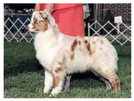
Yukon's daughter AKC CH Thornapple Silken Flame "Halle." Born 2000. By Yukon x Thornapple Godess of The Hunt.