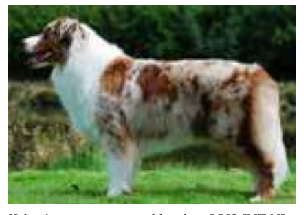
Yukon's great-great-granddaughter RBIS-INT-NL-BE-DE-Dt. CH (Club) CH Skaye's Adoring Shining Sparkle NLJCH, NLJW'10 "Sparkle." Born 2009. By CH Mill Creek's Night Flight x CH Jess's Dancing in the Skaye. (NETHERLANDS)