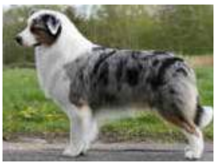
Yukon's double great-grandson DNK-PL CH Leading Angel's Diamond Shockwave "Shahen." Born 2010. By AKC-DNK-GBR-NOR-DEU CH Thornapple Aftershock x DNK-NOCH-KLBVE CH KBHVV15 Thornapple Queen of Diamonds. (DENMARK)