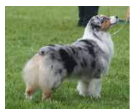
Yukon's great-great-granddaughter CKC BIS GCH Starwoods Exclusive Affair RE CD "Ziva." Born 2010. By AKC GCH Briarbrooks All Rights Reserved x CKC CH Starwoods Focus On A Dream RN.