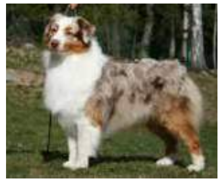
Yukon's daughter Thornapple Moon On Fire "Lunar." Born 2004. By Yukon x CH Thornapple Honey I'm Home. (SWEDEN)