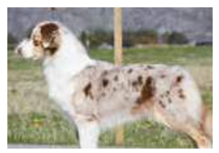
Yukon's great-great-granddaughter BISS NUCH Illumineer Wonderful M "Kiera." Born 2013. By Multi CH Leading Angel's Esteemed Thornapple RN RA HT PT x DKCH DKRLCH Bayshore Stonehaven Vanilla Twilight RN RA LP1. (NORWAY)