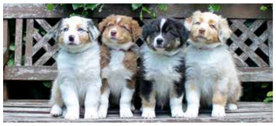
Yukon's grandpups. (Left to right) Oklahoma Sky of Woolly Rocks "Sky." One Dozen Roses of Woolly Rocks "Doa." Ol' Time Rock and Roll of Woolly Rocks "Rock." Oranje Blossom Special of Woolly Rocks "Hazel." Born 2015. By ASCA CH Carolina Calais Get UR Motor Runnin OTDs ATDd RS-N JS-O RN x Lilac Wine of Woolly Rocks.