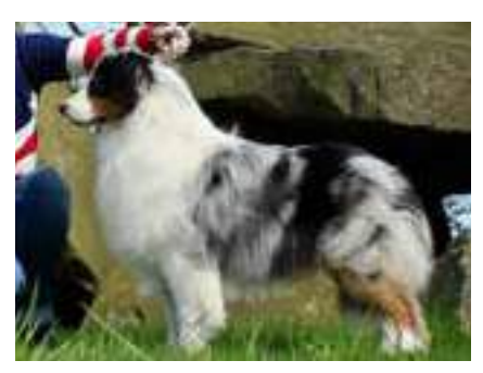
Yukon's great-great-grandson DJCH-Dutch CH Dailo's Running With My Boots On "Frazer." Born 2014. By CH Dailo's Black Label x Dailo's Pocket Full of Sunshine. (NETHERLANDS)