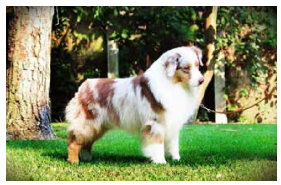
Yukon's great-grandson Multi BIS, Multi CH Risingstar's Billion Dollar Baby "Christoff." Born 2011. By AKC GCH CH-ASCA CH Two By Two's The Pipes Are Piping x CH Risingstar's Sugar 'N Spice. (EL SALVADOR)