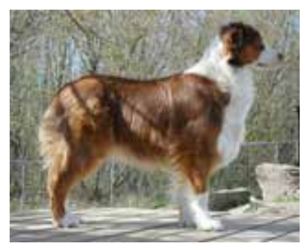
Yukon's great-granddaughter Coultrip's Robin La Rouge "Happy." By AKC CH Echolakes Merlin Rouge x Coultrips Lucille Ball. (CANADA)