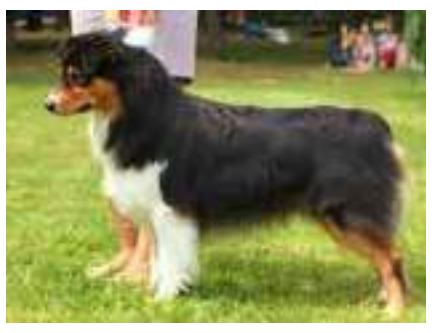
Yukon's great-great-great-grandson Soulwind A Touch of Magic "Oscar." Born 2015. By CH JCH Happy Spark All Fired Up NLJCH, BEJW'13 x CH Los Perros Locos Cute Flowerpower RO-B RO-1 VT CLUBSGR'16 (GERMANY)