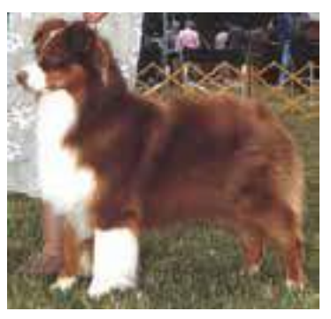
Yukon's son AKC-ASCA CH Rainyday's Preston Phillips "Wally." Born 1999. By Yukon x AKC CH Rainyday's Free As A Bird CGC USASA HOFX-ASCA HOF.