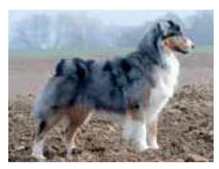
Yukon's son ASCA CH Carolina Calais Get UR Motor Runnin OTDs ATDd RS-N JS-O RN "Huck." Born 2007. By Yukon x AKC-ASCA CH Calais Carolina Mustang Sally. (BELGIUM)