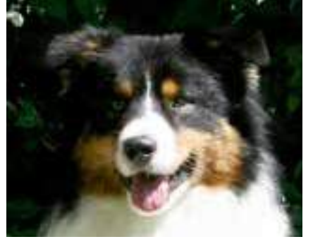
Yukon's grandson VDH CH-Dt CH (Club) ObCH -MVA Mill Creek's Night Flight "Kanoa." Born 2004. VDH Bundessieger 2006/2007/2009. By AKC CH Cobbercrest Ring of Saturn x CH Mill Creek's She'll Be A McMatt. (GERMANY)