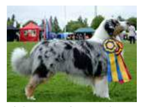
Yukon's great-great-grandson Limistars The Winner Takes It All "Dias." Born 2013. By INT-DNK CH Thornapple Mercury All Jacked Up x Dalorogarden Olivia. (SWEDEN)