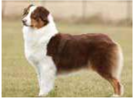
Yukon's great-great-grandaughter Multi CH Leading Angel's Gondola Courtship "Venice." Born 2010. By Multi CH Thornapple Cuba Blue x CH Thornapple Up The Ante. (DENMARK)