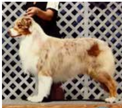
Yukon's son AKC-ASCA CH Rainyday's I'm On Fire HT ROM X-III ROM P-I ROM C-I ASCA HOF "Spark." Born 1999. By Yukon x Cobbercrest Propwash Obla-De USASA HOFX-ASCA HOF.