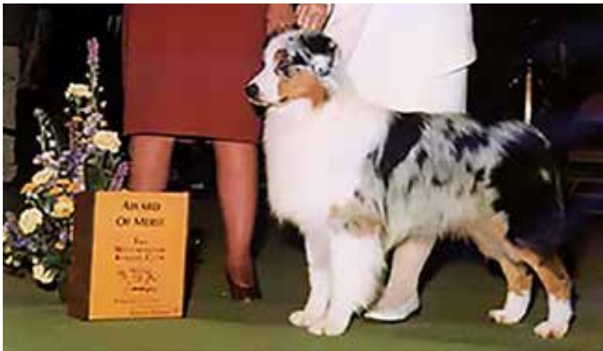
In 1999, Yukon, who was three years old, won an Award of Merit at Westminster. He also received an Award of Merit at Westminster the following year.

After several chiropractic visits over the next few months, Yukon made excellent, rapid improvement. He had a second preliminary exam and received an OFA Good. Soon, Yukon was old enough for his adult OFA grade and it too came back OFA Good.